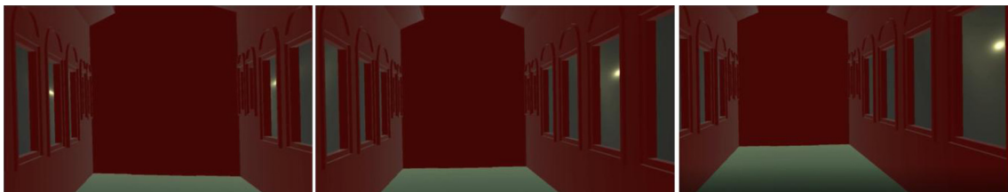
Fig. 2. Three screenshots from the participants' point of view in the moving condition, with with the lights moving from front to back.

The homoscedasticity of the different variables has been tested using Levene tests. These tests revealed acceptable