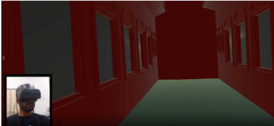
Fig. 1. The experimental virtual environment from the participants' point of view.